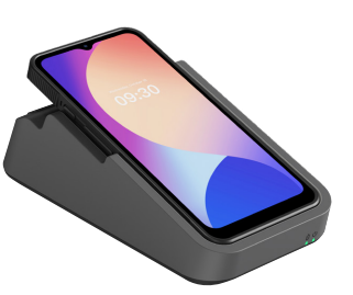
Charging 2500 mAh battery capacity, Charging dock (sold separately)