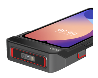
Scanning Processes 1D/2D scanning almost instantly in under 0.3 seconds.