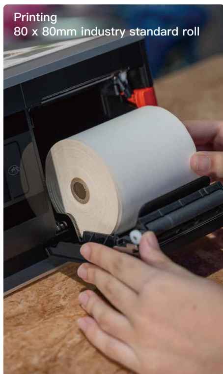
Printing 80 x 80mm industry standard roll