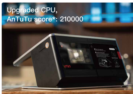
Upgraded CPU, AnTuTu score*: 210000