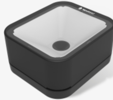
FR27 Urchin stationary scanners