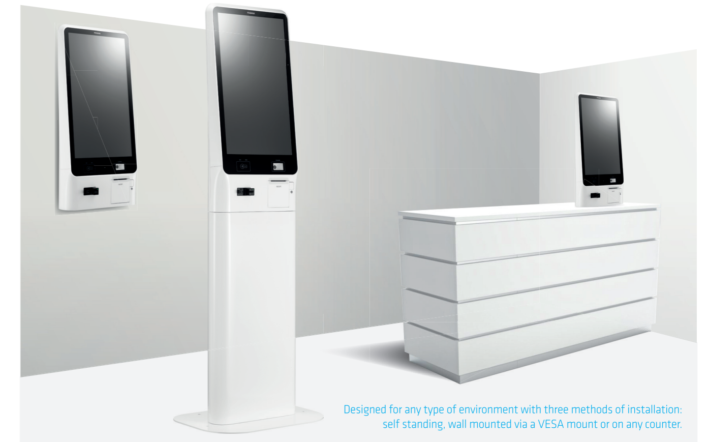
Designed for any type of environment with three methods of installation: self standing, wall mounted via a VESA mount or on any counter.