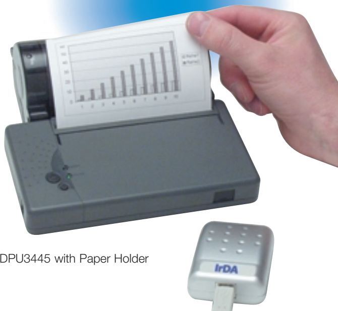
DPU3445 with Paper Holder