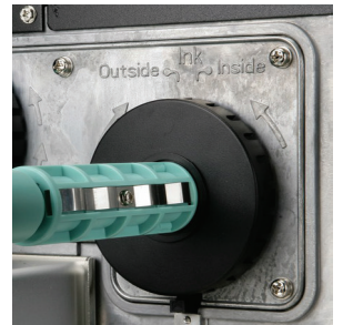
Automatic self adjustment for coated inside/outside ribbons